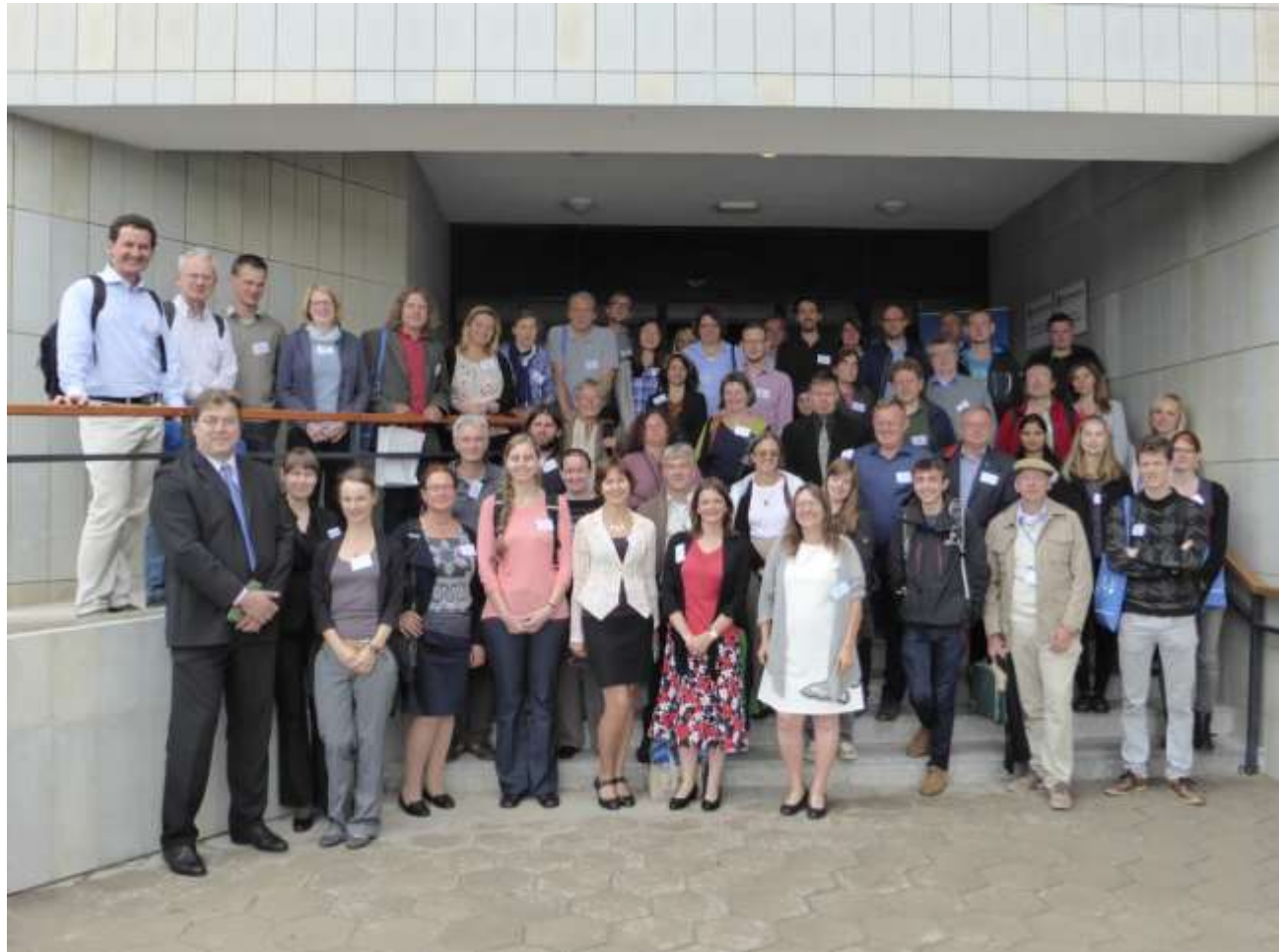
Meeting 2016, 07-09 September, Tartu, Estonia

Pre-Announcement - "Integrated control in oilseed crops" - Zagreb 2018