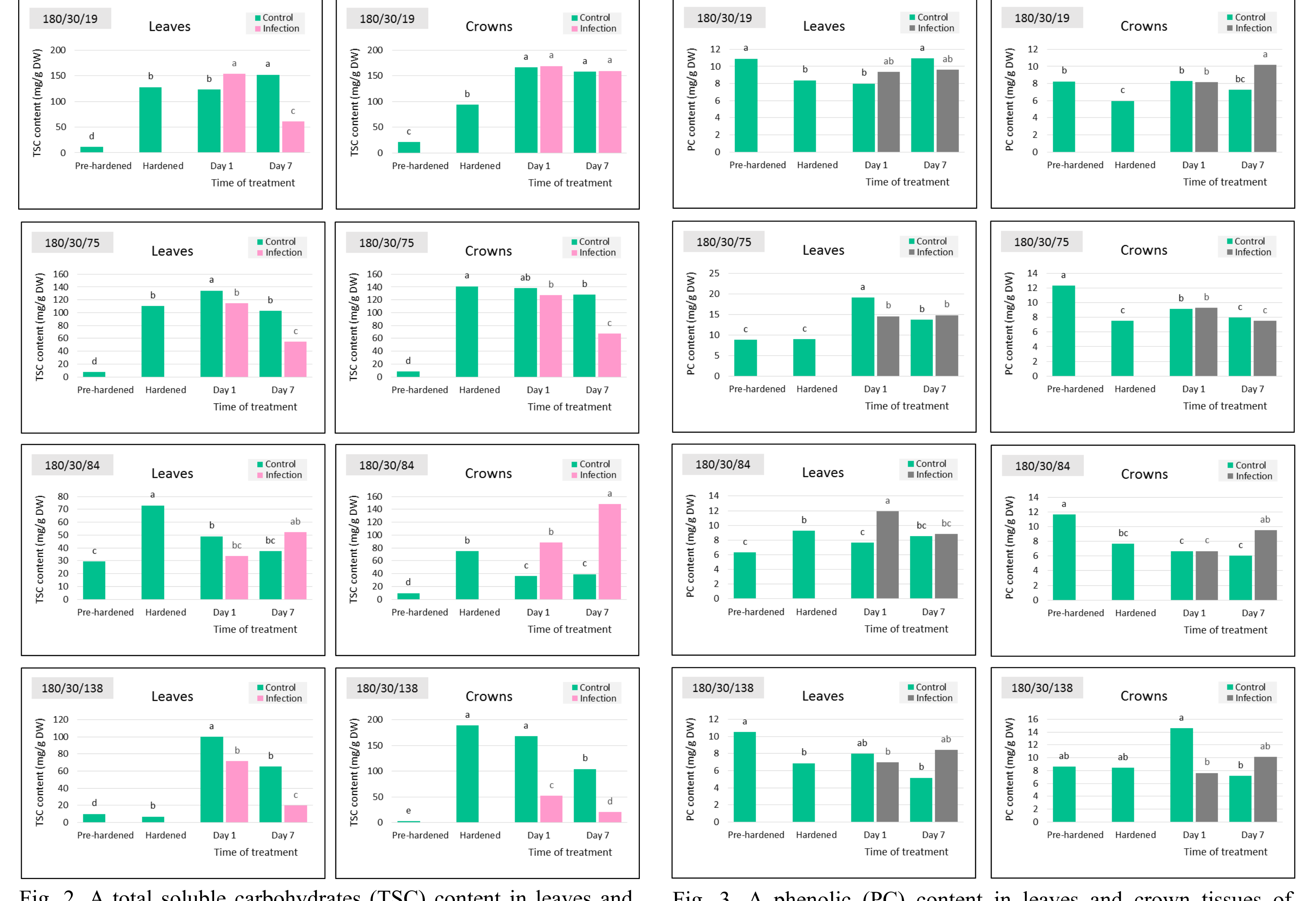
Fig. 2. A total soluble carbohydrates (TSC) content in leaves and crown tissues of L. multiflorum/F. arundinacea introgression forms after pre-hardening and hardening periods, and also on the first and seventh day of inoculation with M. nivale . Means of five replicates are shown. The bars marked with the same letter are not significantly different (Duncan's multiple range test, P<0.05).

Fig. 3. A phenolic (PC) content in leaves and crown tissues of L. multiflorum/F. arundinacea introgression forms after pre-hardening and hardening periods, and also on the first and seventh day of inoculation with M. nivale. Means of five replicates are shown. The bars marked with the same letter are not significantly different (Duncan's multiple range test, P<0.05).